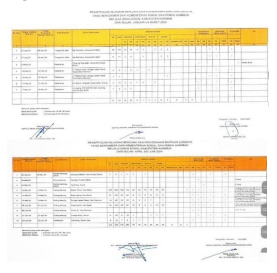
Figure 1. Recapitulation of Disaster Events and Distribution of Logistical Aid Provided by the Ministry of Social Affairs and the Karimun Regional

Aid distribution is tailored to the specific context and needs of each victim. Utilizing a data-driven and symbolically communicative approach, the Social Affairs Office ensures that the assistance provided addresses not only material necessities but also holds social significance for recipients. This approach illustrates that effective disaster response requires integration of logistics, communication strategies, and a deep sociocultural understanding of the victims' lived experiences.