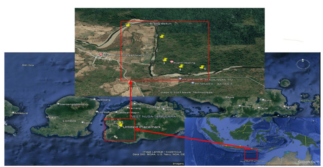
Figure 1 Road Mapping of Mujahiddin - Lampok

The first step in performing geometric road design is to determine a map of the area between the Mujahiddin and Lampok areas. Then from the map of the area, a surface or polygon will be created on Google Earth software that includes coordinate points to plan the road footprint. Next, the surface area will have its elevation obtained through the National Digital Elevation Model (Demnas). Then, using Global Mapper data, Demnas will generate ground contours. The ground contour is used as a reference to create a road trail from the coordinates of Mujahuddin (830681.00, 9207096.00) and Lampok (180309.00, 9213122.00). Suppose a road trace plan has been determined. In this case, the Horizontal Alignment is made by adjusting the flat ground contour.