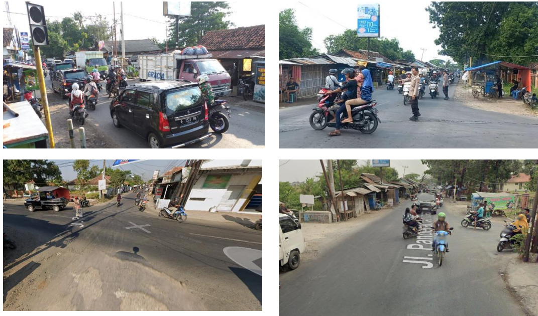
Figure 2 Condition of the Intersection of Jalan Pangeran Antasari-Sumber – Jalan Mertabasih