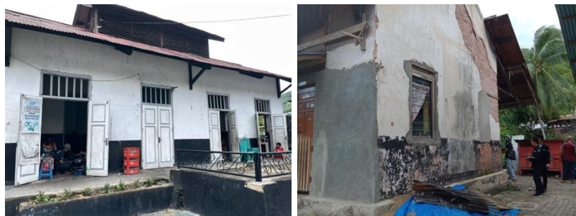
Picture 3. Former prison building turned into guesthouses, local houses, local business activities.

The historical value on Sawahlunto lies not only in the tangible element, but also their intangible element. During the site observation, other than the old building that are still in good condition as structural and architectural, the life of people who occupy that former prison are sustain to recent condition. Some of them are turned into kiosk, local business, or guesthouses. Every traditional houses has a fundamental and significance to the cultural landscape development in an area. Other buildings that has a distinct character and old element become a guideline to develop local architecture that nourish local architecture vocabulary in general (Ngurah et al., 2021).