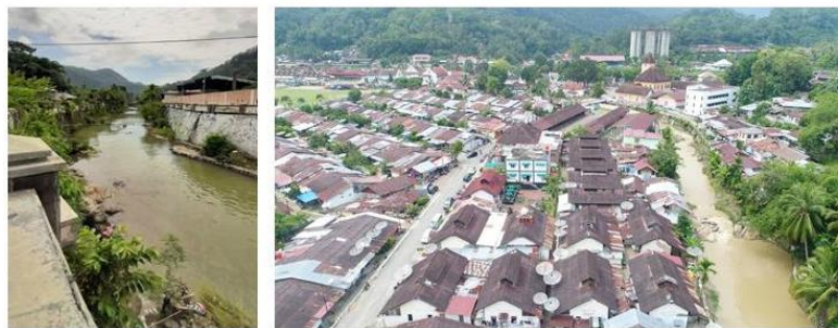
Picture 1. Batang Sumpahan (the river) located near to the relic of the former prison for orang rantai (the labor)

Regarding Sawahlunto city where valleys, rivers, civilization laid surround the city, a definition of cultural landscape can definitely bring out more values to what they have until now. We need to consider human influences, the invisible cultural landscape (such as myth, belief, and traditional customs), and even the perceived image that created by the outsiders or tourist.