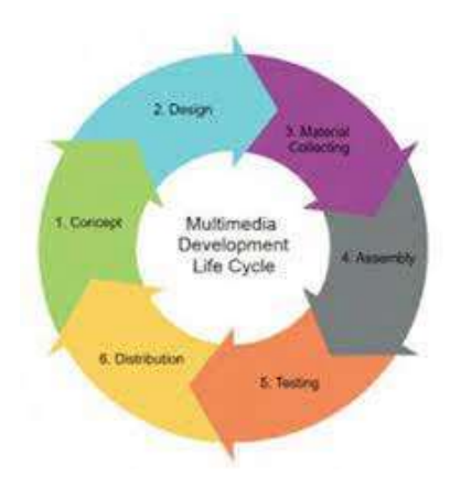
Figure 4.2. MDLC concept