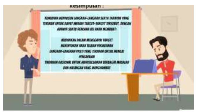
Figure 4.12. Unification in learning media – 6