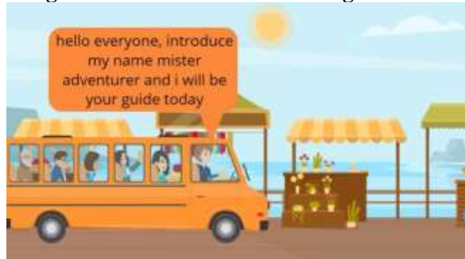
Figure 4.9. Unification in learning media - 3