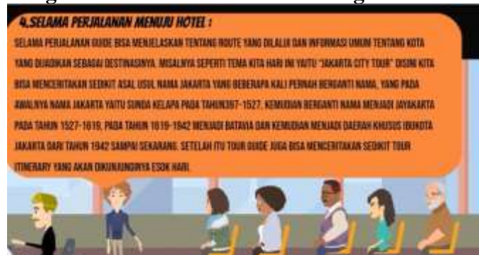
Figure 4.11. Unification in learning media – 5