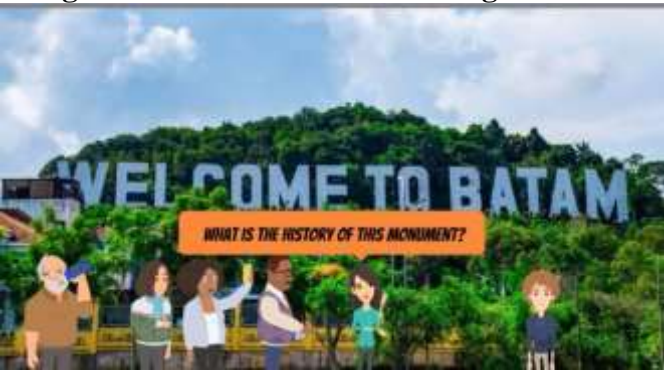
Figure 4.10. Unification in learning media – 4