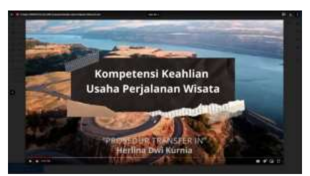
Figure 4.15. Distribution on the Google Drive channel