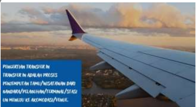
Figure 4.7. Unification in learning media