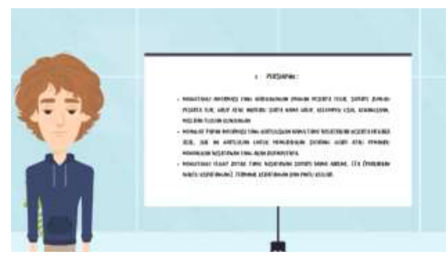
Figure 4.8. Unification in learning media - 2