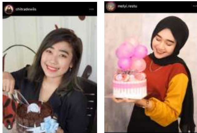
Figure 4.3 Implementation results

Selebgram is a powerful strategy to create interest and trend in society. Using celebgrams as a promotional medium for a product can increase the attention of potential consumers when the item is introduced to social media. The role of Instagram celebrities in the business world makes a product or service easily recognized and known by the public. This is because it is influenced by the prestige of a celebgram. The use of celebgrams in developing this business uses local celebgrams originating from Batam City where these celebgrams have quite a large number of followers