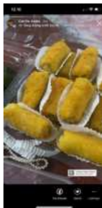
Figure 4.4 The results of the implementation of making Instagram

Levelnext using stories or feeds Instagram for promoting a business via Instagram stories can also help improve traffic account as well as build brand awareness . Because this feature can build interactive communication with followers