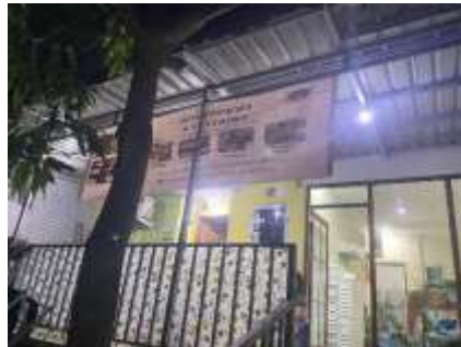
Figure 4.1 Implementation results

are being offered by the seller's telephone number which can be contacted if you want to place an order.