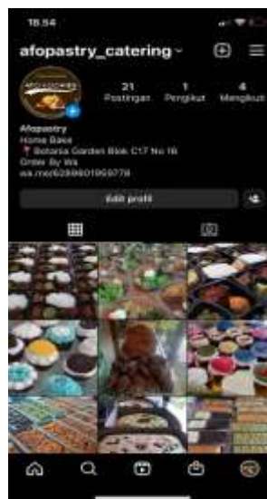
Figure 4.2 Implementation results

The next stage is registering a social media account, namely Instagram where previously the business owner only had a Facebook account so that in advancing this business it is necessary to create other social media accounts such as Instagram where currently many use Instagram as the main social media in everyday life, the name of the Instagram account is created. based on the name that is often used by consumers when looking for similar products and is easily remembered by the public, namely @afopastry_catering