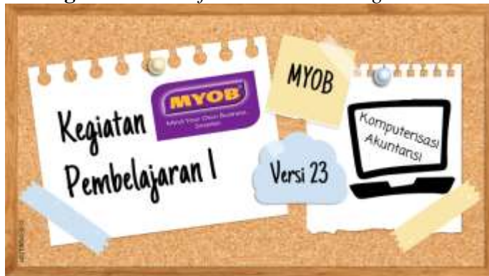
Figure 4 Example of Initial Display of Material Discussion PPT