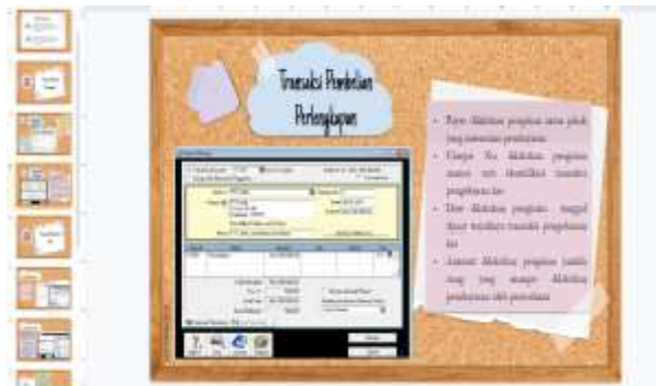
Figure 5 Example Display Discussion of Learning Materials