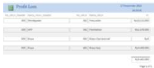
Picture 10 Profit and Loss Report

The second report in the Report Menu is the profit and loss report which includes information on the income generated and expenses borne by MSMEs in one period. This report serves to evaluate and find out the development of MSMEs through the profits or losses generated by MSMEs during a certain period.