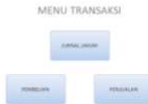
Picture 4 Transaction Menu

The Transaction menu is a menu that contains forms such as general journals, purchase journals, and purchase journals. The form in this transaction menu is used to record MSME financial and non-financial transactions.