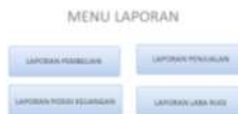
Picture 8 Report Menu

The Report menu is a menu that contains MSME financial reports which include important information to assist the owner's decision-making process. The owner can display financial reports according to the desired date, fill in the desired date on from and to or until first. Then, click on the report you want to view.