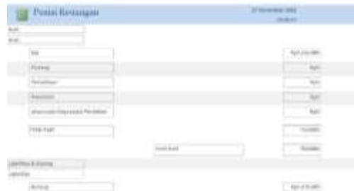
Picture 9 Financial Position

condition of MSMEs so that owners can make strategic decisions for the development of MSMEs.