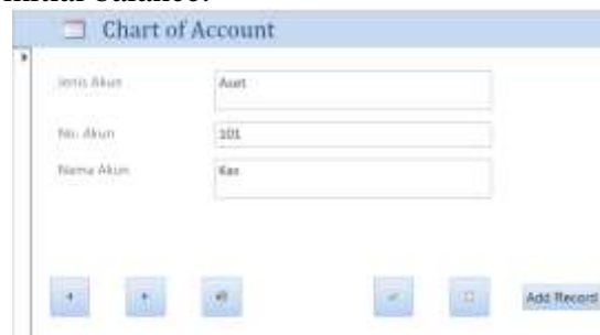
Figure 3 Display of chart of account Source: Data Processed, 2022

Chart of account form is designed according to the transaction of Toko Indah Kasih. This form consists of account header no, account header name, account no, account name, and initial balance.