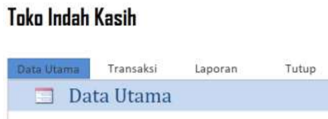
Figure 2 Display of the main menu form

Chart of account form is designed according to the transaction of Toko Indah Kasih. This form consists of account header no, account header name, account no, account name, and initial balance.