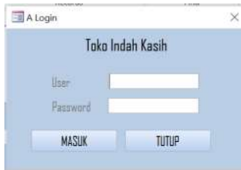
Figure 1 Display of the login menu