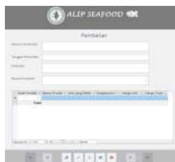
Picture 8. Purchase Form

Supplier form is used to record information about suppliers. This form consists of supplier code, supplier name, supplier address, and supplier phone number. Supplier forms can be used to store suppliers' information which makes it users easier to contact their suppliers.