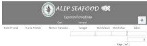
Picture 21. Stock Report

Purchase report is a report that presents all purchase transactions made in the specified period. This report consists of purchase number, purchase date, supplier code, supplier name, and purchase balance.