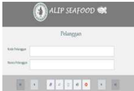
Picture 6. Customer Form

Inventory form is used to enter the information of products for sale. The inventory form consists of product code, product name, supplier code, supplier name, selling price, and purchase price.