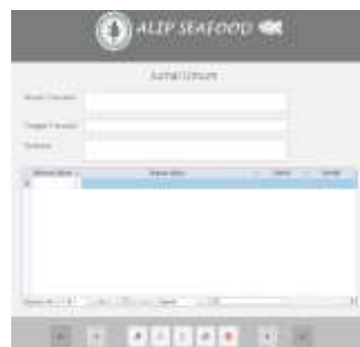
General Journal Form