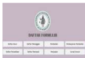
Picture 2. Form List

The main menu will be displayed as soon as the system is run. The main menu allows users to access the forms and reports easily. Users can access the list of forms in the form section. In addition, users can also display a list of company reports in the report section.