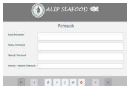
Picture 7. Supplier Form

Customer form is used to record information about customers. This form consists of a customer code and customer name. Customer forms can be used to help users know their customer information.