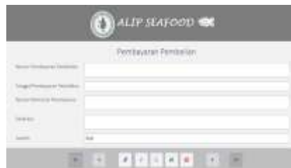
Purchase Payment Form