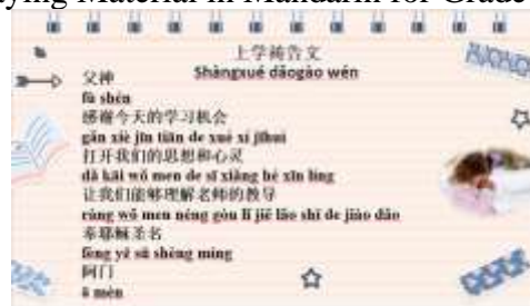
Picture 1. Praying Material in Mandarin for Grade One

In this first material from first grade teaching materials discussing how to pray in Mandarin or how Christians pray in Mandarin this teaching material is described as below: