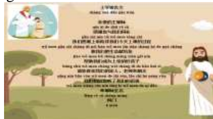
Praying Material in Mandarin for Grade Five