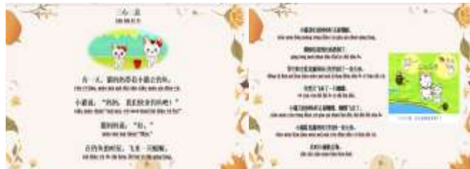
Short Stories Material in Mandarin for Grade Four