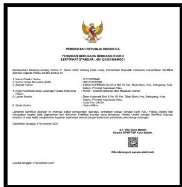
( Pict. 1.1 NIB Jawara Rasa)