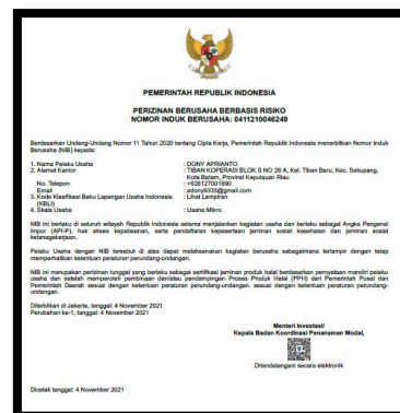
(Pict. 1.2 NIB Dapur Oma Nana)