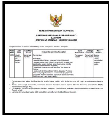
(Pict. 1.1.1 Attach NIB Jawara Rasa)