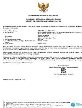
Figure 2, NIB