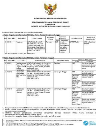
Figure 3, NIB Attachment