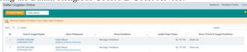
Picture 1 Proof of Divorce Claim Case Registration using the E-Court service before getting the case number