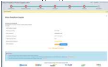
Picture 2 Proof of Divorce Lawsuit Registration Status using the "E-Court" Service of the Religious Courts