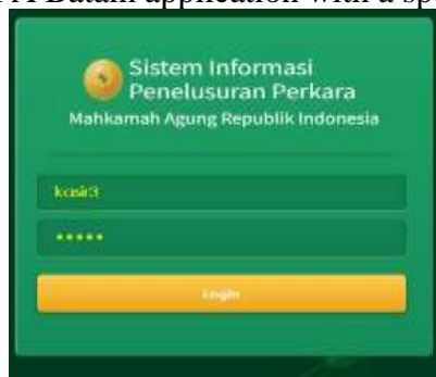
Picture 2 Display of Login in SIPP PA Batam Account