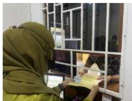
Picture 3 Author's Documentation Provide Evidence of SKUM (Certificate To Pay) to the Litigation