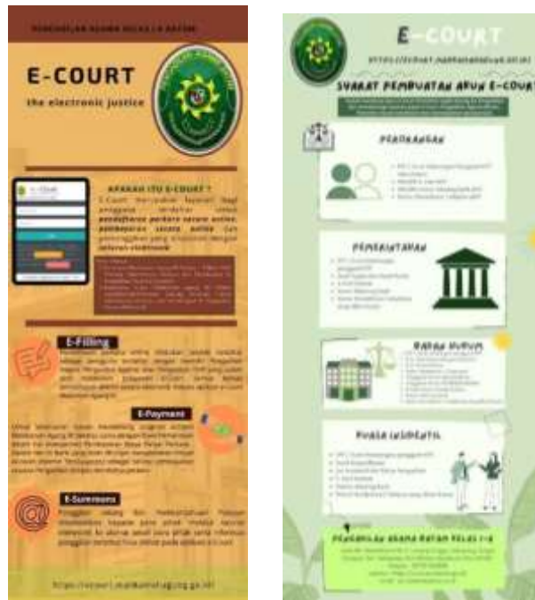
Picture 5 E-Court banner design that will be displayed in the Religious Courts