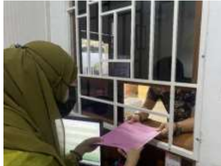
Picture 1 Author's documentation when receiving the lawsuitfile which will be registered and given a case number