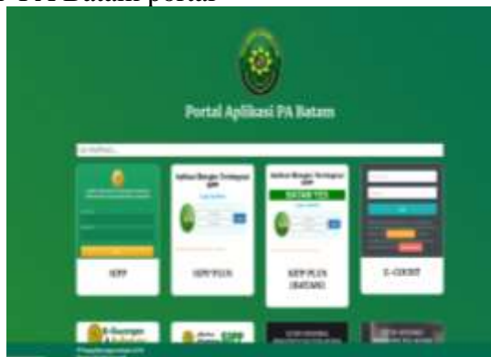
Picture 1 Display of Application Portal belonging to the Batam Religious Court