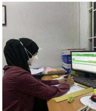
Picture 2 Author's documentation when giving the lawsuit case number according to the order of SIPP (case tracing information system) Batam Religious Court