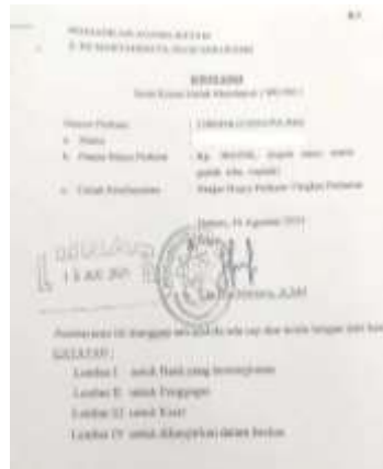
Picture 4 Proof of SKUM given to the Applicant/Plaintiff (Certificate to Pay)