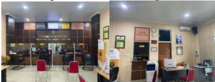
Picture 4 Documentation of one-stop integrated service center Batam Religious Court

The procedure for registering a lawsuit using the E-Court service is as follows: Currently the E-Court service is only devoted to advocates. In this case, the registered user after having an account must go through the advocate validation stage in the local High Court area where the advocate is sworn in. Procedures for registering lawsuits online using the Supreme Court's E-Court service