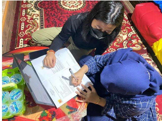
Picture 2 documentation with the mariyuk.id business owner to get a certificate of implementation