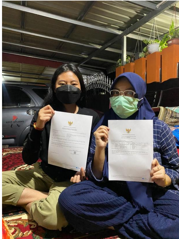
Picture 4 documentation with the mariyuk.id business owner after obtaining a business legal permit