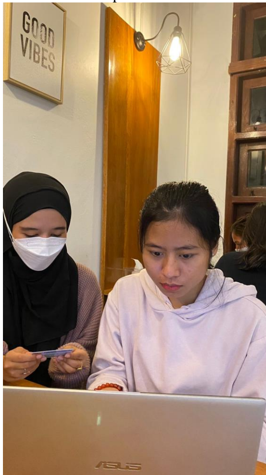
Picture 3 documentation with mariyuk.id business owners when you want to register a business license by preparing the required documents