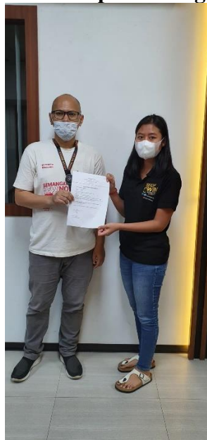
Picture 1 documentation with the owner of the Pondok Seblak business after obtaining a business license