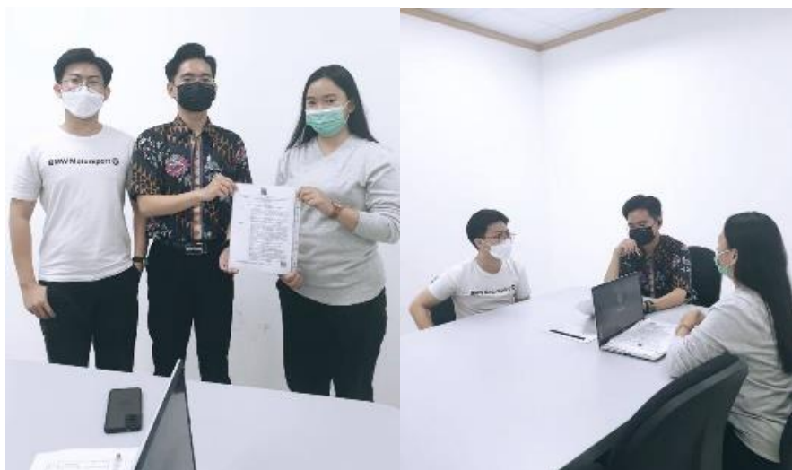
Picture 3. Submission of BP Business License to Partner Representative