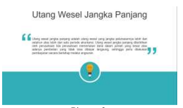
Picture 2. Definition of Long-term Notes Payable