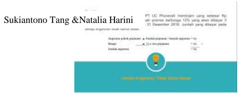
Picture 4. Example Question If the amount of Installment not the same