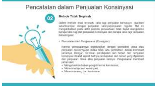
Picture 12. Recording of Consignment Sales with Unseparated Methods