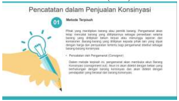
Picture 11. Recording of Consignment Sales with Separated Methods