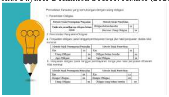
Picture 6. Recording of Bonds Payable Transaction

The expected outputs from the consignment sales material are the understanding of the consignment sale, the parties involved, the characteristics of the consignment sale, the gains & losses from the consignment sale, the consignment agreement which contains the rights and obligations of the trustee and commissioner, the method of recording consignment sales which is divided into separate methods, not separated, and if the consignment goods are still left. Based on the result above, below is a summary of digital teaching materials of consignment sales.