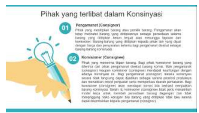
Picture 8. Involved Parties in Consginment Sales