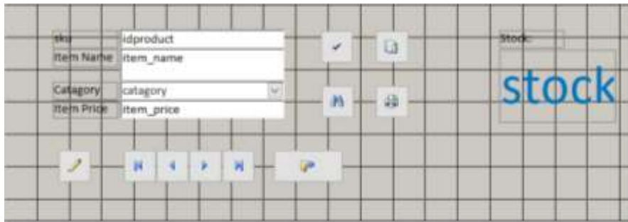
Account List Menu Display, source : Processed Data, 2021