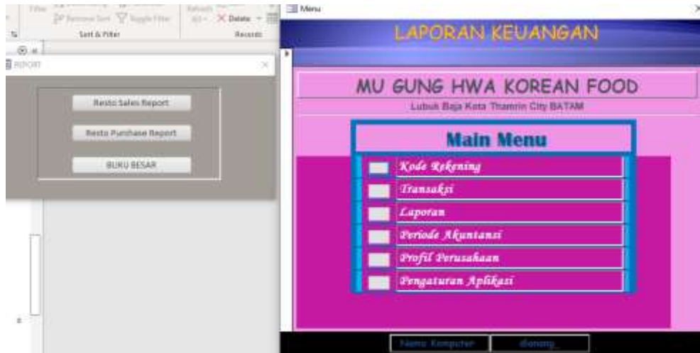
Ledger Menu Display

The general ledger contains all transactions that occurred during the period against each list of accounts. The transaction details of each account will be filled in automatically along with the debit, credit, and balance amount that will be automatically reduced. Each account in the category has alternating white and gray colors so that users do not experience difficulties in distinguishing transactions for each account.