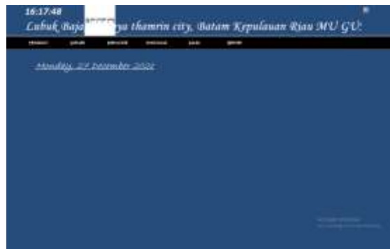
Main Menu Display

The main menu will display like the one below when the login is successful. The main menu itself has a function to make it easier for system users to open and apply each form.