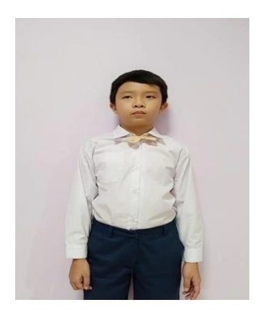
Figure 1.2 Photo of Student Participating in Globe National Plus School Competition

At the beginning of the activity, he made a request to the Globe National Plus school foundation to do practical work. The researcher discussed with the foundation what problems this school was facing and after that the problem was that there was a decrease in students at this school because the school registration fee was in accordance with the costs of other schooling in Batam City so finding out the cause of the decline in this school was the lack of organizational activity between schools like having the courage to take part in the competition because with the competition you can approach the community by introducing that there is this school in the city of Batam and the community will pay attention to this school because they see that children who go to school in this place have great potential so that many parents are interested in sending them to school, his son at the school.