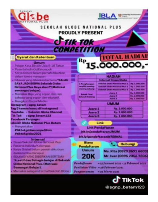
Figure 1.1 Brochure of the Globe National Plus School Tik Tok Competition 1

of having children. Which is a very positive increase in pupils at Globe National Plus school with pride. Total prizes were also given to children who had worked hard with the amount of fifteen million rupiahs to encourage children's creativity so that the children could increase their enthusiasm to continue working with the full support of Globe National Plus School because the child made the school's name fragrant and well known in the name of society. The school also creates advertisements involving students such as National Teacher's Day and Chinese New Year which are attached below.