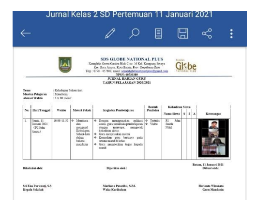
Figure 1.3 Globe National Plus School Teacher Daily Journal

module that provides information on this school so that researchers make it easy and comfortable in this journal, namely making this journal into one page so that it saves paper usage and saves time for writing only important things in teaching in this class. With this, teachers can take advantage of the extra time to do other important things so as to ease the work of a teacher which makes a teacher's ability to increase and be more efficient.