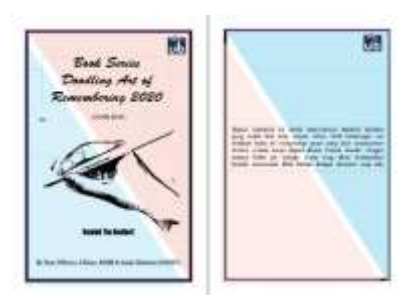
Figure 3. Front cover and cover back

For the front cover using a sketch drawn by us and also the back cover. You can see that there are writings from the title of the book itself and also us. This section was edited using Adobe Illustrator by being redrawn using a tablet device and then designed using Adobe Indesign software and the text font used was Brush Script Std with a size of 30pt and also the additional font Minion Pro with a size of 12pt and for the bottom font intended to we using the Minion Pro Bold font with a size of 12pt and the size of this book is 148 x 210mm, also each front and back cover displays the University logo (See Fig 3).