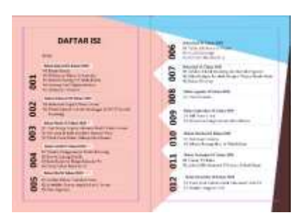
Figure 4. List of Contents

minimalistic elements in the layout and adds a white color space. The page is made like this so that readers can enjoy the contents of the doodle book that has been designed. For table of contents layout use Microsoft PhagsPa font size 14pt (See Fig 4).