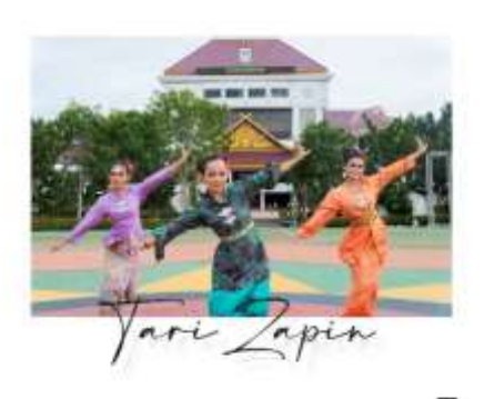
Figure 18. Contents of Photo Book on Pages 14 Back Cover