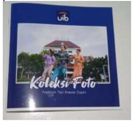
Figure 20. Printed photo book Conclusion

photo book design research conducted by the author, the author draws the conclusion that this research can provide information and be able to attract the public to get to know fashion photography on dance dancers created by Zapin in the city of Batam. Photo books that are packaged with a simple display and various layout views on each page can give everyone an impression that is not boring and the contents of each page have several photos and there are short writings so that it is easy to understand every message conveyed by the author.