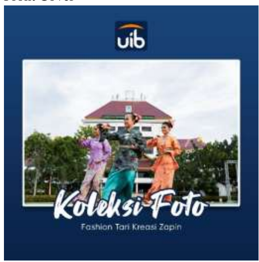
Figure 11. Photo Book Front Cover

In this section is the front cover of the photobook. It can be seen that there is the Batam International University logo, a photo of fashion photography of dance dancers created by zapin along with the inscription of the book title "Photo Collection of Zapin's Creative Dance Fashion Photo"