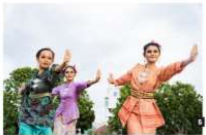
Figure 14. Contents of Photo Book on Page 5