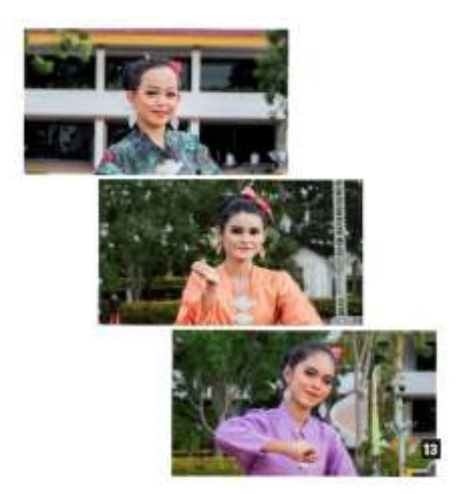
Figure 17. Contents of Photo Book on Pages 10,11, 12, and 13