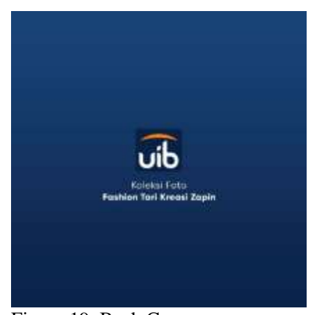
Figure 19. Back Cover