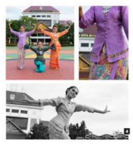
Figure 13. Contents of the Photo Book on Pages 2, 3, and 4