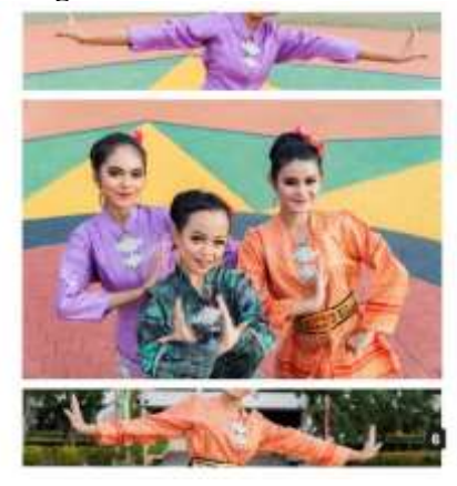
Figure 15. Contents of Photo Book on Page 6