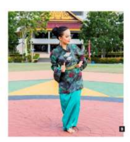
Figure 16. Contents of Photo Book on Page 7, 8, and 9