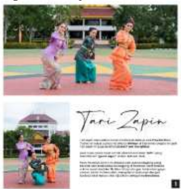
Figure 12. Contents of Photo Book on Page 1

It can be seen that the photos were taken in the Engku Putri square.