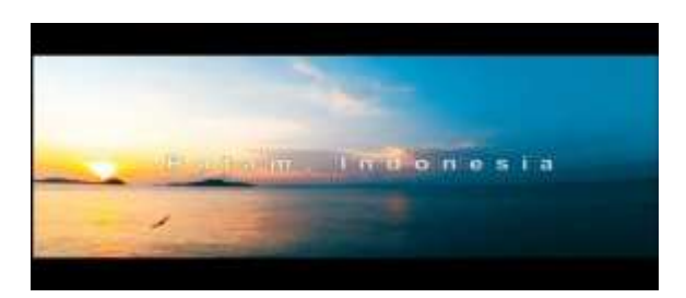
Figure 5. Opening Video

and wisdom of the eldery. The purpose of this video story of eldery is to provide procedures and information about video editing techniques using Continuity Cutting. And knowing a story from other people who are aged 50 and over, to convey the story to the public, especially young people as knowledge. After merging videos and adjusting audio to suit using Vegas pro 19.0 software, the author will take screenshots or documentation at the finishing stage on the rendered video or during an interview.