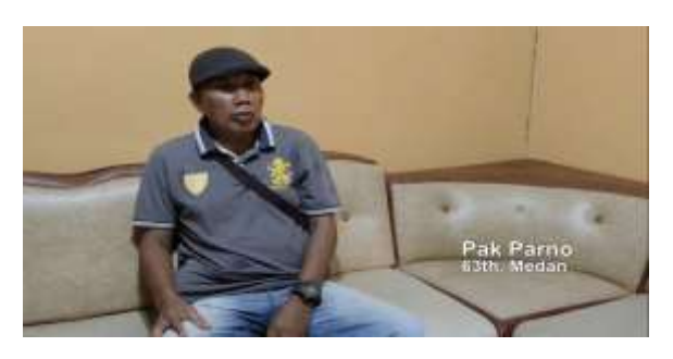
Figure 8. Second Source Identity

v In this first source interview picture, the author asks 3 questions to the first source, namely, the most memorable life experience for the source, the source's view on today's youth, messages from sources for today's youth. These questions were asked to the first source.