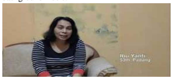
Figure 6. First Source Identity

At the opening of this video, the author presents a cinematic of the ocean accompanied by text containing the location and title of the video along with background music and the area around the speaker's house accompanied by text and background music.