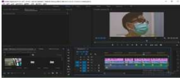
Figure 16. Fourth Source Interview

In this fourth source interview image, the author asks 5 questions to the fourth source, namely, do you believe that Covid-19 is very dangerous?, since when have you been positive for Covid-19?, how do you feel when you are exposed to Covid-19?, handling Covid -19 from the hospital or at home?, what is your message for the community affected by Covid-19?.