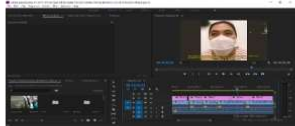
Figure 19. Fifth Source Interview

In this picture of the identity of the fifth source, the author narrates the identity of the fifth source named junita, 23 years old. With video images as a layout appearance for interviews using online video calls.