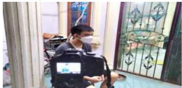
Figure 8. First Source Documentation

In this first source interview image, the author asks 5 questions to the first source, namely, do you believe that Covid-19 is very dangerous?, since when have you been positive for Covid-19?, how do you feel when you are exposed to Covid-19?, handling Covid -19 from the hospital or at home?, what is your message for the community affected by Covid-19?.