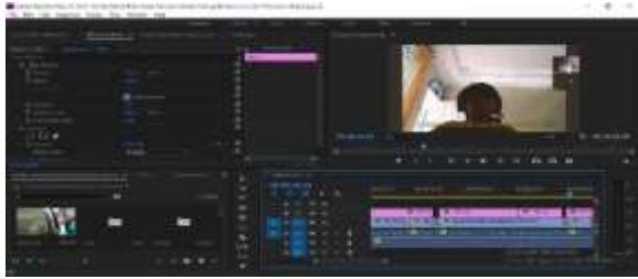
Figure 10. Second Source Interview

In this second source interview image, the author asks 5 questions to the second source, namely, do you believe that Covid-19 is very dangerous?, since when have you been positive for Covid19?, how do you feel when you are exposed to Covid-19?, handling Covid 19 from the hospital or at home?, what is your message for the community affected by Covid-19?.