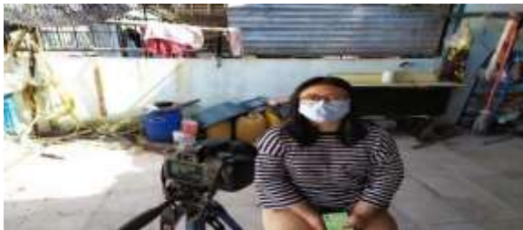
Figure 23. Sixth Source Documentation

In this sixth source interview image, the author asks 5 questions to the sixth source, namely, do you believe that Covid-19 is very dangerous?, since when have you been positive for Covid-19?, how do you feel when you are exposed to Covid-19?, handling Covid -19 from the hospital or at home?, what is your message for the community affected by Covid-19?.