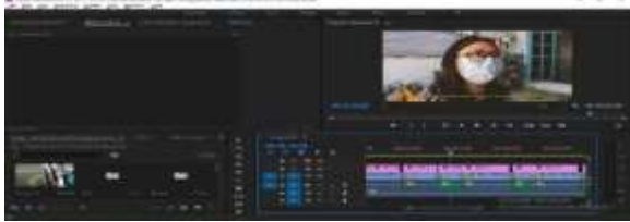
Figure 22. Sixth Source Interview

In this sixth source interview image, the author asks 5 questions to the sixth source, namely, do you believe that Covid-19 is very dangerous?, since when have you been positive for Covid-19?, how do you feel when you are exposed to Covid-19?, handling Covid -19 from the hospital or at home?, what is your message for the community affected by Covid-19?.