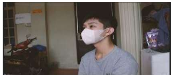
Figure 14. Third Source Documentation

In this third source interview image, the author asks 5 questions to the third source, namely, do you believe that Covid-19 is very dangerous?, since when have you been positive for Covid-19?, how do you feel when you are exposed to Covid-19?, handling Covid -19 from the hospital or at home?, what is your message for the community affected by Covid-19?.