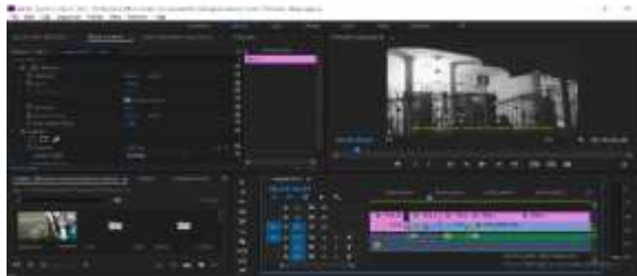
Figure 6. First Source Identity

In the opening of this video, the author narrates the problems regarding Covid19 and the goals conveyed by the author, and the author also narrates the existence of 6 sources who will be interviewed