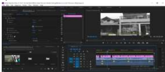
Figure 12. Third Source Identity

Documentation In this documentation image, the author takes photos at the location of the interviewee when the second source is conducting an interview questions asked by an online video call.