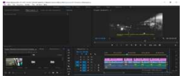
Figure 15. Fourth Source Identity

In this documentation image, the author takes photos at the location of the interviewees when the third source is conducting interviews the questions asked.