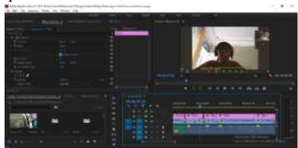
Figure 9. Second Source Identity

In this documentation image, the author takes photos at the location of the interviewees when the first source is conducting interviews or answering questions asked.