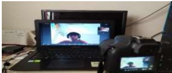
Figure 11. Second Source

In this second source interview image, the author asks 5 questions to the second source, namely, do you believe that Covid-19 is very dangerous?, since when have you been positive for Covid19?, how do you feel when you are exposed to Covid-19?, handling Covid 19 from the hospital or at home?, what is your message for the community affected by Covid-19?.