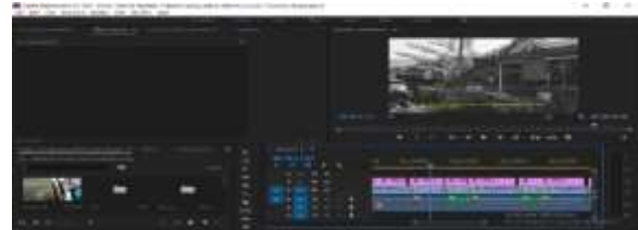
Figure 21. Sixth Source Identity

In this documentation image, the author takes photos at the location of the interviewees when the fifth source is conducting interviews questions asked on an online video call.