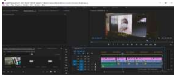
Figure 18. Fifth Source Identity

In this documentation image, the author takes photos at the location of the interviewees when the fourth source is conducting interviews the questions asked.