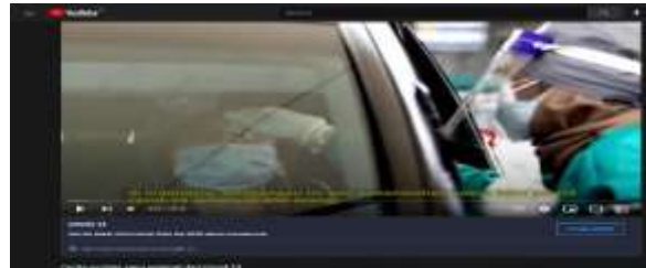
Figure 25. Youtube

At the evaluation stage, after producing a video that can be watched, then this video will be shown to the supervisor for suggestions and input that will be used as a guide for improvements to the video. And the author will upload a video testimony of Covid-19 survivors which contains the stories of six sources of Covid-19 survivors from the final results obtained from views, likes, and positive comments from the audience. The final result of this Covid-19 survivor video testimony will be submitted to the supervisor first, to be given final feedback on the video design, and after obtaining approval, the video design will be fully implemented through the youtube channel.