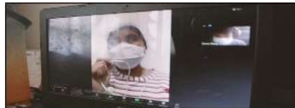
Figure 20. Fifth Source Documentation

In this fifth source interview image, the author asks 5 questions to the fifth source, namely, do you believe that Covid-19 is very dangerous?, since when have you been positive for Covid-19?, how do you feel when you are exposed to Covid-19?, handling Covid -19 from the hospital or at home?, what is your message for the community affected by Covid-19?.