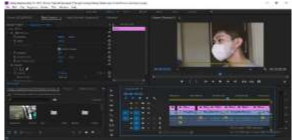
Figure 13. Third Source Interview

In this picture of the identity of the third source, the author narrates the identity of the third source named jumiliono, who is 21 years old.