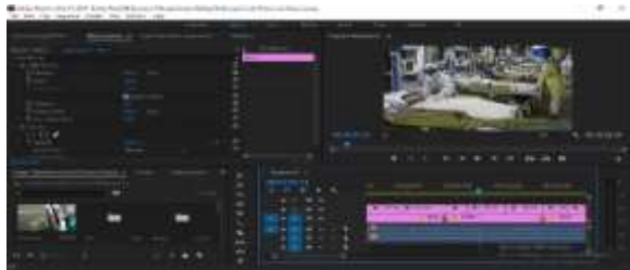
Figure 5. Opening Video

using Continuity Cutting. And knowing a story from another person who survived Covid-19, to convey that story to the public as knowledge and increasing awareness of Covid-19. After merging videos and adjusting audio to suit using Adobe Premiere Pro CC 2017 software, the author will take screenshots or documentation at the finishing stage on the rendered video or during an interview.