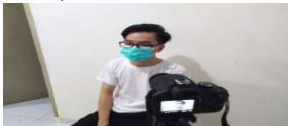
Figure 17. Fourth Source Documentation

In this fourth source interview image, the author asks 5 questions to the fourth source, namely, do you believe that Covid-19 is very dangerous?, since when have you been positive for Covid-19?, how do you feel when you are exposed to Covid-19?, handling Covid -19 from the hospital or at home?, what is your message for the community affected by Covid-19?.