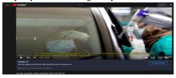
Figure 25. Youtube

At the evaluation stage, after producing a video that can be watched, then this video will be shown to the supervisor for suggestions and input that will be used as a guide for improvements to the video. And the author will upload a video testimony of Covid-19 survivors which contains the stories of six sources of Covid-19 survivors from the final results obtained from views, likes, and positive comments from the audience. The final result of this Covid-19 survivor video testimony will be submitted to the supervisor first, to be given final feedback on the video design, and after obtaining approval, the video design will be fully implemented through the youtube channel.