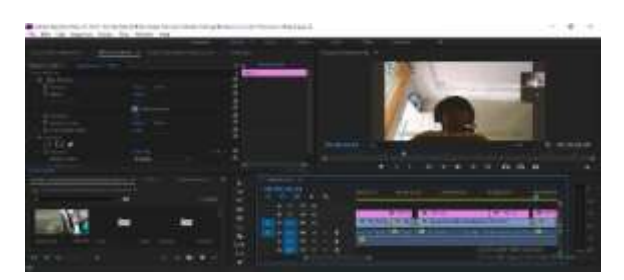
Figure 10. Second Source Interview

In this second source interview image, the author asks 5 questions to the second source, namely, do you believe that Covid-19 is very dangerous?, since when have you been positive for Covid19?, how do you feel when you are exposed to Covid-19?, handling Covid 19 from the hospital or at home?, what is your message for the community affected by Covid-19?.