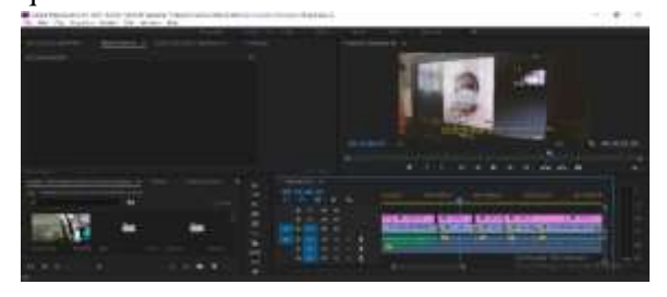
Figure 18. Fifth Source Identity

In this documentation image, the author takes photos at the location of the interviewees when the fourth source is conducting interviews the questions asked.