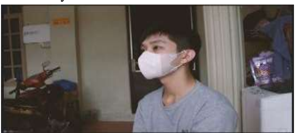
Figure 14. Third Source Documentation

In this third source interview image, the author asks 5 questions to the third source, namely, do you believe that Covid-19 is very dangerous?, since when have you been positive for Covid-19?, how do you feel when you are exposed to Covid-19?, handling Covid -19 from the hospital or at home?, what is your message for the community affected by Covid-19?.