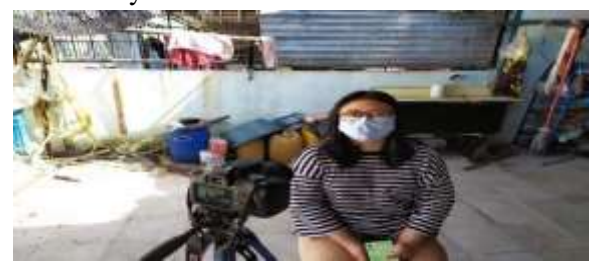
Figure 23. Sixth Source Documentation

In this sixth source interview image, the author asks 5 questions to the sixth source, namely, do you believe that Covid-19 is very dangerous?, since when have you been positive for Covid-19?, how do you feel when you are exposed to Covid-19?, handling Covid -19 from the hospital or at home?, what is your message for the community affected by Covid-19?.