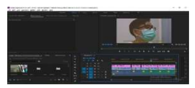
Figure 16. Fourth Source Interview

In this fourth source interview image, the author asks 5 questions to the fourth source, namely, do you believe that Covid-19 is very dangerous?, since when have you been positive for Covid-19?, how do you feel when you are exposed to Covid-19?, handling Covid -19 from the hospital or at home?, what is your message for the community affected by Covid-19?.