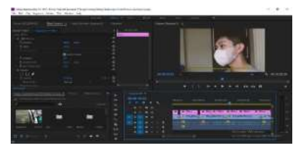
Figure 13. Third Source Interview

In this picture of the identity of the third source, the author narrates the identity of the third source named jumiliono, who is 21 years old.