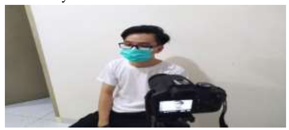
Figure 17. Fourth Source Documentation

In this fourth source interview image, the author asks 5 questions to the fourth source, namely, do you believe that Covid-19 is very dangerous?, since when have you been positive for Covid-19?, how do you feel when you are exposed to Covid-19?, handling Covid -19 from the hospital or at home?, what is your message for the community affected by Covid-19?.