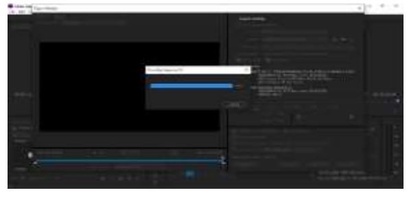
Figure 24. Render

In this documentation image, the author takes photos at the location of the interviewees when the sixth source is conducting interviews the questions asked.