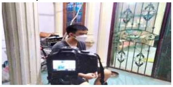
Figure 8. First Source Documentation

In this first source interview image, the author asks 5 questions to the first source, namely, do you believe that Covid-19 is very dangerous?, since when have you been positive for Covid-19?, how do you feel when you are exposed to Covid-19?, handling Covid -19 from the hospital or at home?, what is your message for the community affected by Covid-19?.