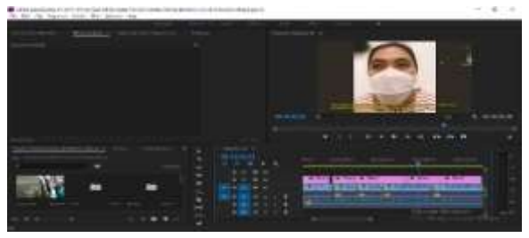
Figure 19. Fifth Source Interview

In this picture of the identity of the fifth source, the author narrates the identity of the fifth source named junita, 23 years old. With video images as a layout appearance for interviews using online video calls.