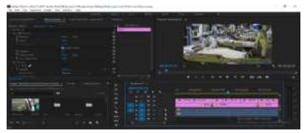
Figure 5. Opening Video

using Continuity Cutting. And knowing a story from another person who survived Covid-19, to convey that story to the public as knowledge and increasing awareness of Covid-19. After merging videos and adjusting audio to suit using Adobe Premiere Pro CC 2017 software, the author will take screenshots or documentation at the finishing stage on the rendered video or during an interview.