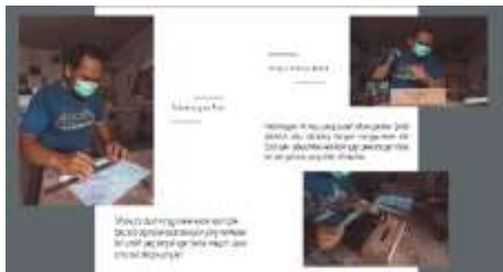
Figure 3. Process making handcraft

The next page shows the process of pattern making and design. the left side present a picture of the craftsman doing some pattern making to design a product to be made. As it has presented on the right side contains a picture one of the craftsman is doing the process of wood carving (see fig 3).