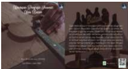
Figure 2. Front cover and cover back

For the front cover, the author uses a photo of a craftsmen who is doing the engraving and has the title, author's name, and the name of the supervisor. And for the back cover display, it contains a synopsis of the purpose of making a photobook along with ordering contacts, each front and back cover displays the University logo (See Fig 2).