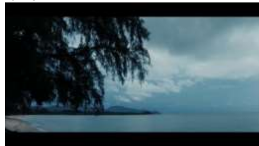
Figure 1.5 Pongkar Beach

Showing the natural beauty of the Pongkar waterfall which is a must-visit place if you are in Tanjung Balai Karimun.