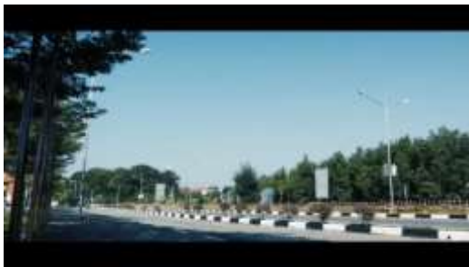
Figure 1.3 Coastal Area

Showing the opening scene taken using a canon eos m-100 camera with the words Tanjung Balai Karimun in the middle of the video with a Coastal Area tourist spot in the background.