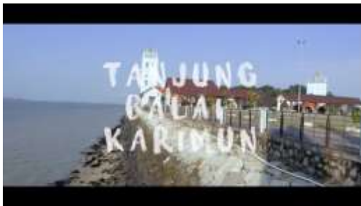
Figure 1.2 Opening Scene

Showing the opening scene taken using a canon eos m-100 camera with the words Tanjung Balai Karimun in the middle of the video with a Coastal Area tourist spot in the background.