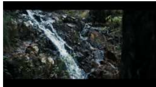
Figure 1.4 Pongkar Waterfall

Showing views of the Coastal Area tourist attractions, using the Wide Shot technique.