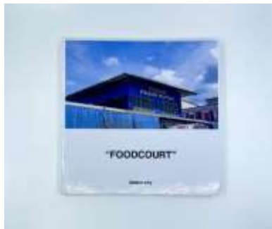
Figure 5. Result of Photobook

At this approval stage, the author asked for the supervisor's approval before printing the Photobook that has been designed, revised, and evaluated by the supervisor so that it has been confirmed that there will be no more changes.