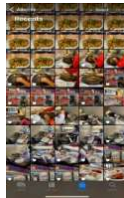
Figure 3. The process of taking pictures

At the stage of data collection, the author collected the necessary data by interviewing the informants and observing the location of the food court.