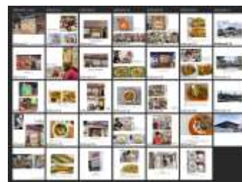
Figure 4. The process of editing pictures

At this design stage, pictures taken in the previous stage were selected and then color grading was carried out before the editing process. The pictures were edited using Adobe Lightroom Mobile software. The editing stage was carried out with the Adobe Photoshop CC 2017 application with a size of 20 x 20 cm.