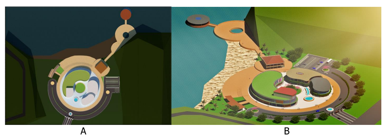
Figure: A) Masterplan, B) Render

Hall 1 will be the main hall of the whole building. This hall will be the place to attain the main purpose, which is the paradise for painters and connoiseurs of paintings. Exhibition room at the ground floor as a kind of museum for to be enjoyed by visitors who meets the condition by paying for tickets. Second floor and third floor will be the paradise for painters with good facilities and sceneries. Unlike the second floor, third floor is an open area, so that the painters can enjoy the scenery without being blocked by window glass.