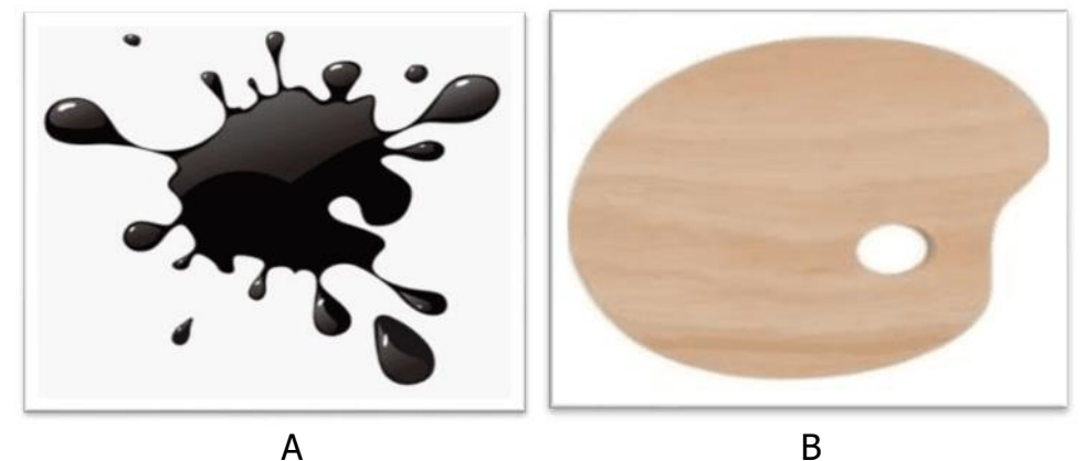
Figure: A) Paintdrop, B) Palette

Paintinggir, a sustainable architectural design using pallete concept and paintdrop as a form of a development area, makes development with the purpose to provide tools, facilities and places for painters and connoiseurs of paintings. A site area far from the center of the city doesn't give out too much noise, creating serenity. With serenity, convenience and sceneries that sparks motivation, one will use those as supports to explore this fascinating field. The zoning and spacial order will be as such: Hall 1, Hall 2, Hall 3, Cafeteria, Foodcourt, and Seadeck.