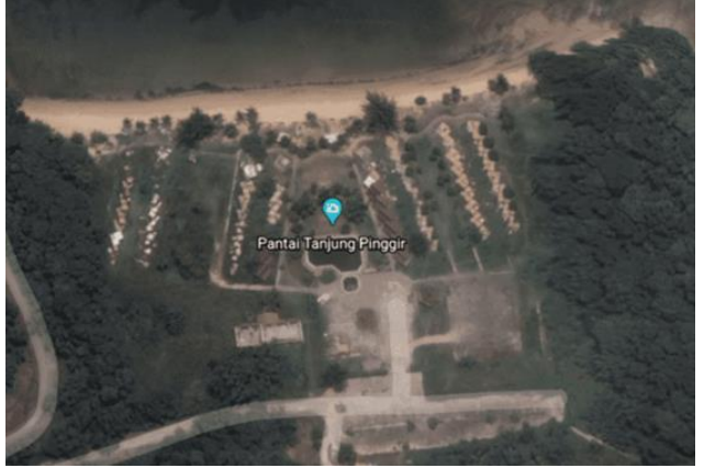
Figure: Site of Tanjung Pinggir

Tanjung Pinggir is located North of Batam City, Sekupang district, Kepulauan Riau, at 1°8′32.11″N 103°55′24.35″E. Development site area is 32,074 m<sup>2</sup> wide. 27,414.42 m<sup>2</sup> from the site is used for development building area. The scenery of the sea, Singapore, and some highlands from various directions supports the development of a studio for the public that can be rented as a painting spot, holding seminars and exhibitons.